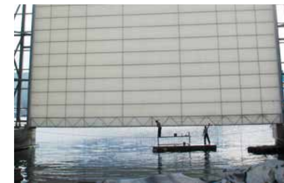
Megadoor vertical lifting fabric doors are the ideal solution for enclosed berths or dry docks.