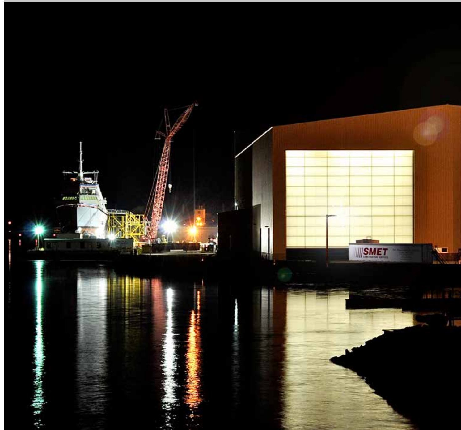
© ASSA ABLOY Entrance Systems AB BR-SH|ORGEN-1.17-1406 Technical data subject to change without notice.