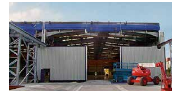
Specialized door designs are possible, such as a T-shape to accommodate a crane on rails.

VT Shipbuilding, Portsmouth Naval Base, UK "The Megadoor vertical lifting fabric door supplied by ASSA ABLOY Entrance Systems provided a relatively simple solution to a complex problem, without the need for additional extensive steelwork supports, which would have been required for the alternative sliding door solutions considered."